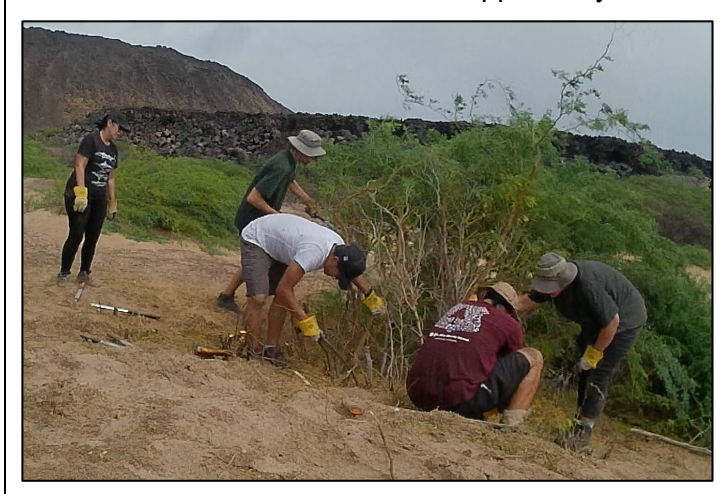
Mexican thorn removal on one of our important green turtle nesting beaches.

The first volunteer Sunday took place at North East Bay, which is approximately 46.66 ha in size. Volunteers were shown how to use tools such as loppers and silky saws during Mexican thorn tree removal. The importance of applying herbicides during Mexican thorn tree removal was discussed and volunteers had the opportunity to see how it is applied.