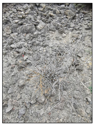
Results Foliar application with Sendero® herbicide

Foliar application is being tested in Waterside Nature Reserve on 95 trees. The area is approximately 181.29 ha in size. Sendero® herbicide was applied by pressurized knapsack sprayers. Three different nozzles (jet, fan, and cone) were included in the trials to determine which will work best for the treatment of Mexican thorn.