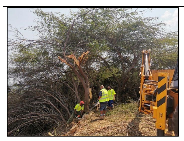
Tree removal near the airfield.