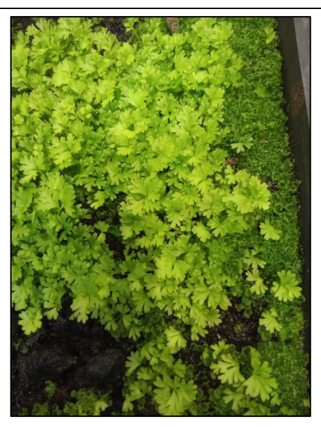
Pictures of Prosopis and Delonix species (left) and Pteris adscensionis (right).