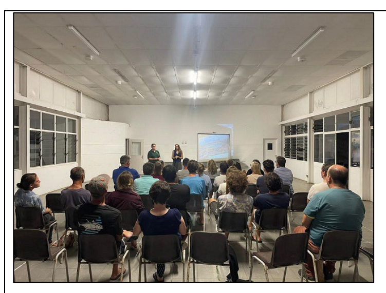
Public meeting to introduce the Mexican thorn Control Project.